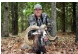
Mouflon Sheep

Missouri's spring turkey season has two parts. Hunters age 6 through 15 shot 3,945 turkeys during the youth season April 10 and 11. This boosted the combined spring turkey harvest to 46,199, which is 1,491 more than last year.