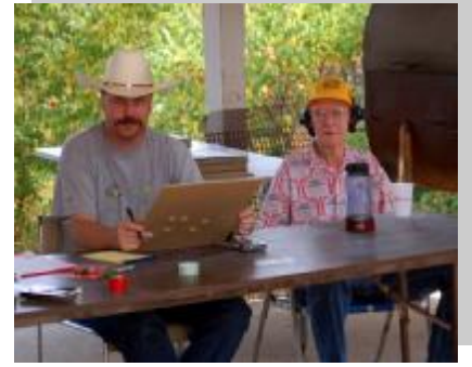
BGH Annual Shoot August 15th